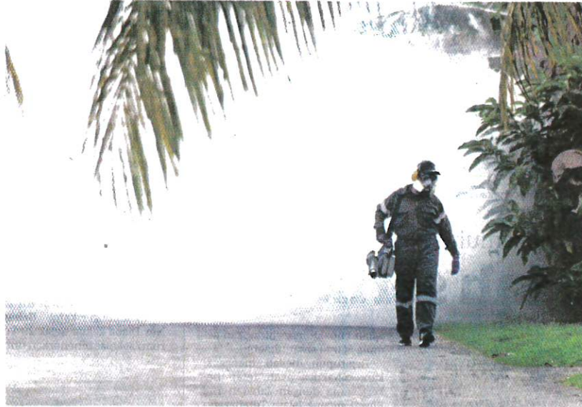
SEORANG petugas melakukan semburan asap mencegah nyamuk aedes di sekitar kejiranan. – GAMBAR HIASAN