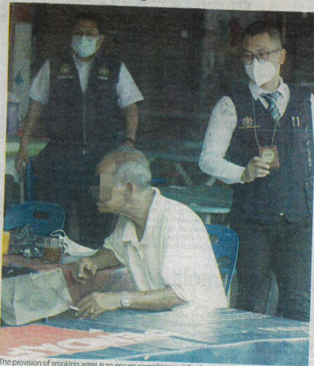
The provision of smoking areas is to ensure compliance while also ensuring cleanliness of public places.